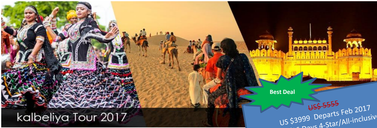
kalbeliya Tour 2017